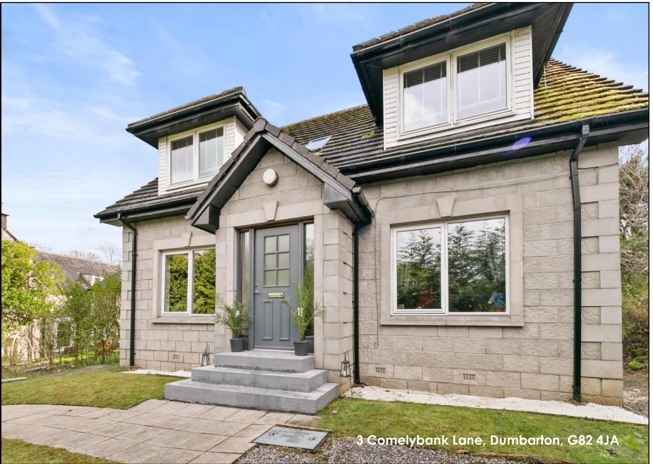
3 Comelybank Lane, Dumbarton, G82 4JA

Rarely available on the open market, this 4 bedroom professionally built detached villa will surely appeal to the most discerning buyer. The caring owners have meticulously improved and maintained the property to an extremely high standard since the original build.